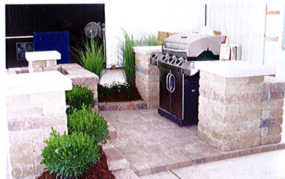
The finished product!

Seth also had nothing but praise for the students. "I had a great time working with the students on the build. I feel that I have a very high standard for work ethic and I was very impressed with how hard the students worked. They jumped right into working on the project and grasped project layout and building principles with a breeze. They surpassed all my expectations!"