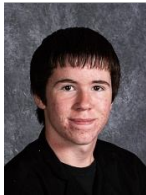
Dakota High Culinary Arts