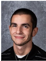
Cody Ford Auto Collision